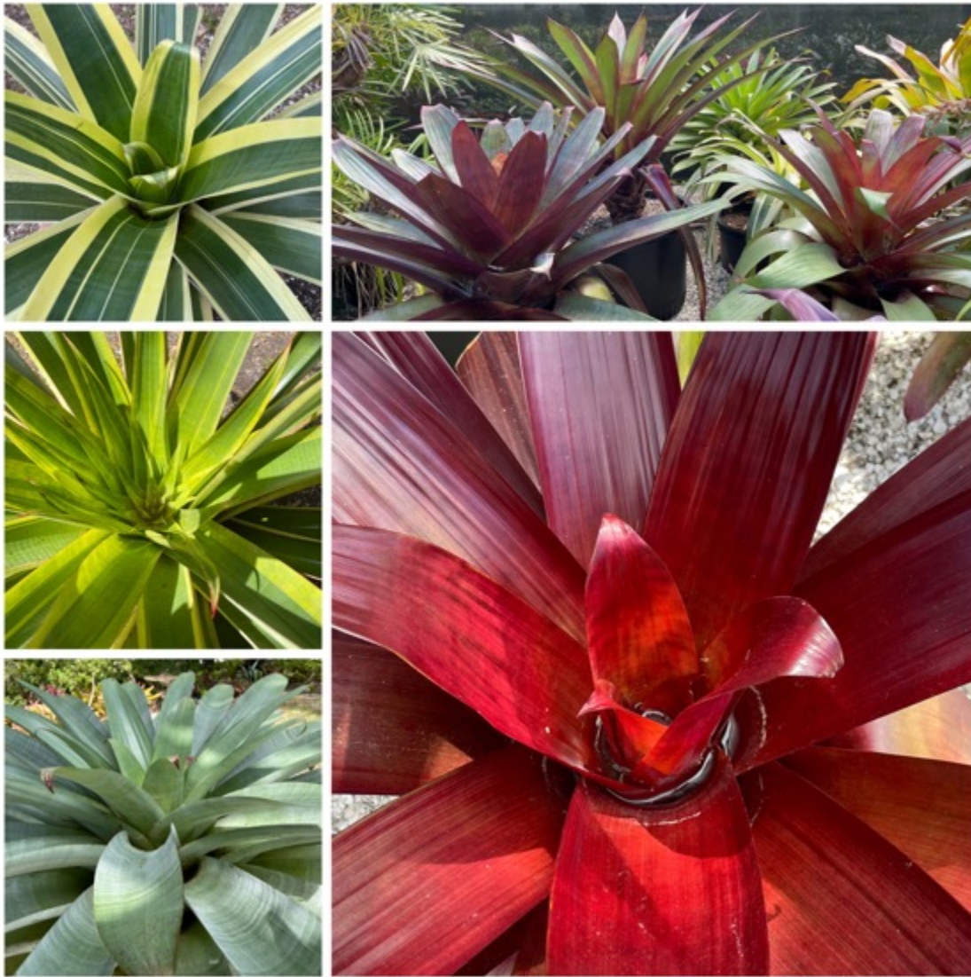
Counterclockwise from upper left: Alcantarea 'P.I.T.A.'; 'Aurora'; brasiliensis; 'Merlot'; and a group of Alcantareas.

A photos of Alcantareas growing in the area: