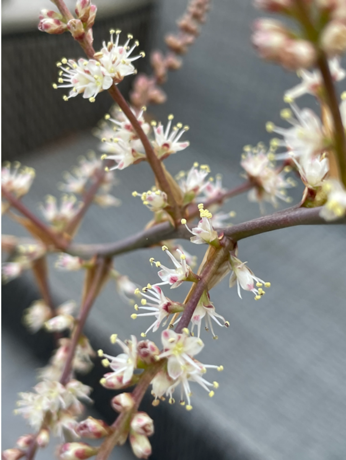
Hechtia rosea x marnier lapostollei cross from Ray Lemieux. Hechtias have separate male and female forms. In the male form the pistil is not fully developed, whereas in the female, like this plant, the stamens are not functional.