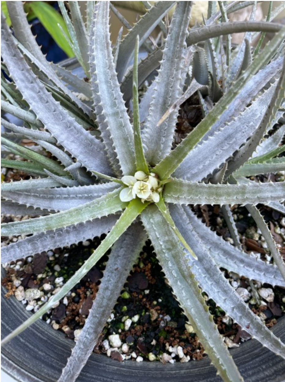
Forzzaea leopoldi-horsrtii, formerly Cryptanthus leopoldi-Horstii grows in cracks in rocks in Minas Gerais, Brazil.