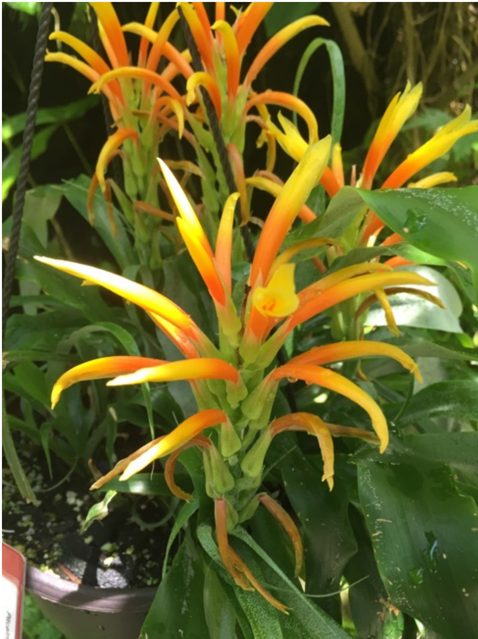
Pitcairnia andreana