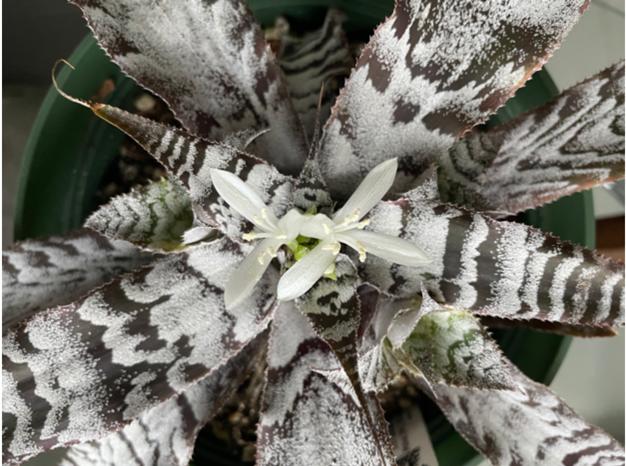
Cryptanthus 'Absolute Zero' is a Jim Irvin hybrid.