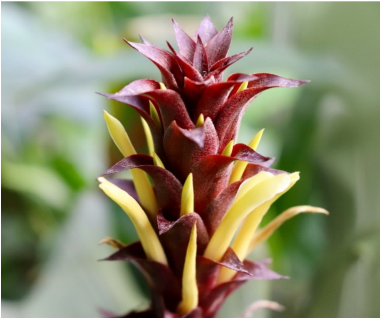
Pitcairnia atrorubens